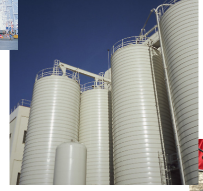
Contents in a silo