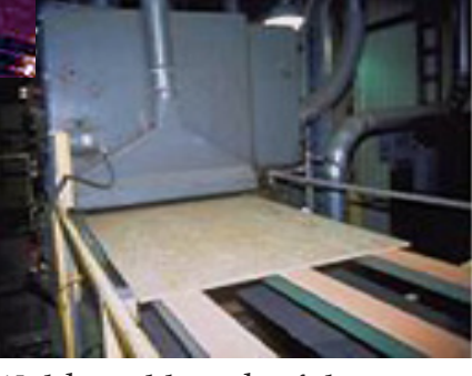
Width and length of doors, etc