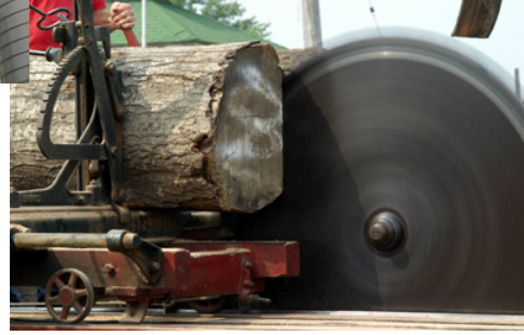
Log length and location to a saw